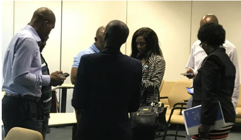
Figure 1. Stakeholders in Gaborone swapping phone numbers after the narratives workshop