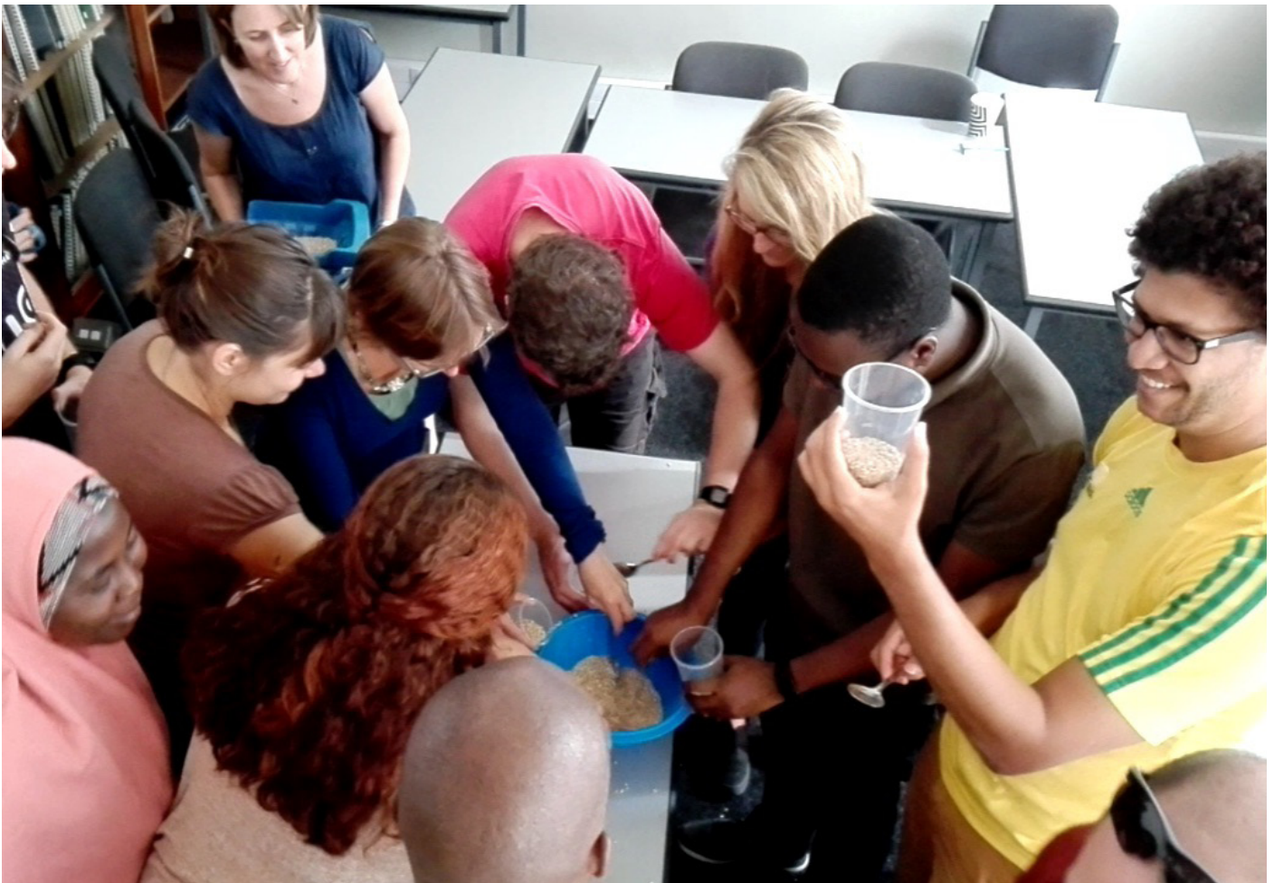
Figure 1: Testing the spilling the beans tool with CSAG staff

The first tool, Spilling the Beans, is a game that addresses discrepancies in the conceptual understanding of the term 'resilience'. The game takes participants through a range of scenarios in order for the participants to come to understand two common conceptual formulations of resilience. Importantly the game does not indicate which formulation is the "correct" one. It is at the discretion of the users if they would like to agree on a single definition or not. The aim is to make explicit different interpretations. The second tool is an e-learning module aimed at deepening understanding of poorly understood terms, namely: adaptation and adaptive capacity. This tool explores these concepts in the city context, unpacking various features of adaptation and adaptive capacity, providing local city examples, and guidelines on determining adaptation pathways.